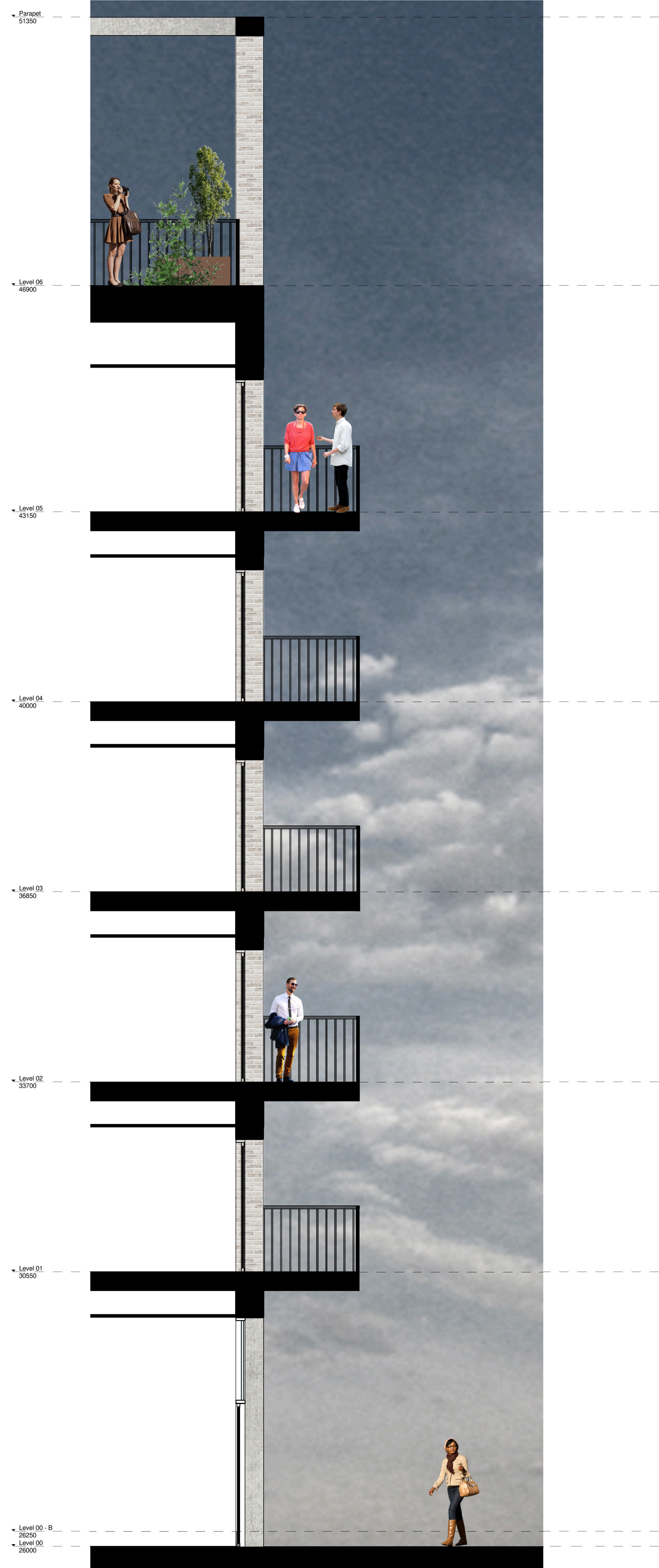
1 Block F - Study Section 1 : 50