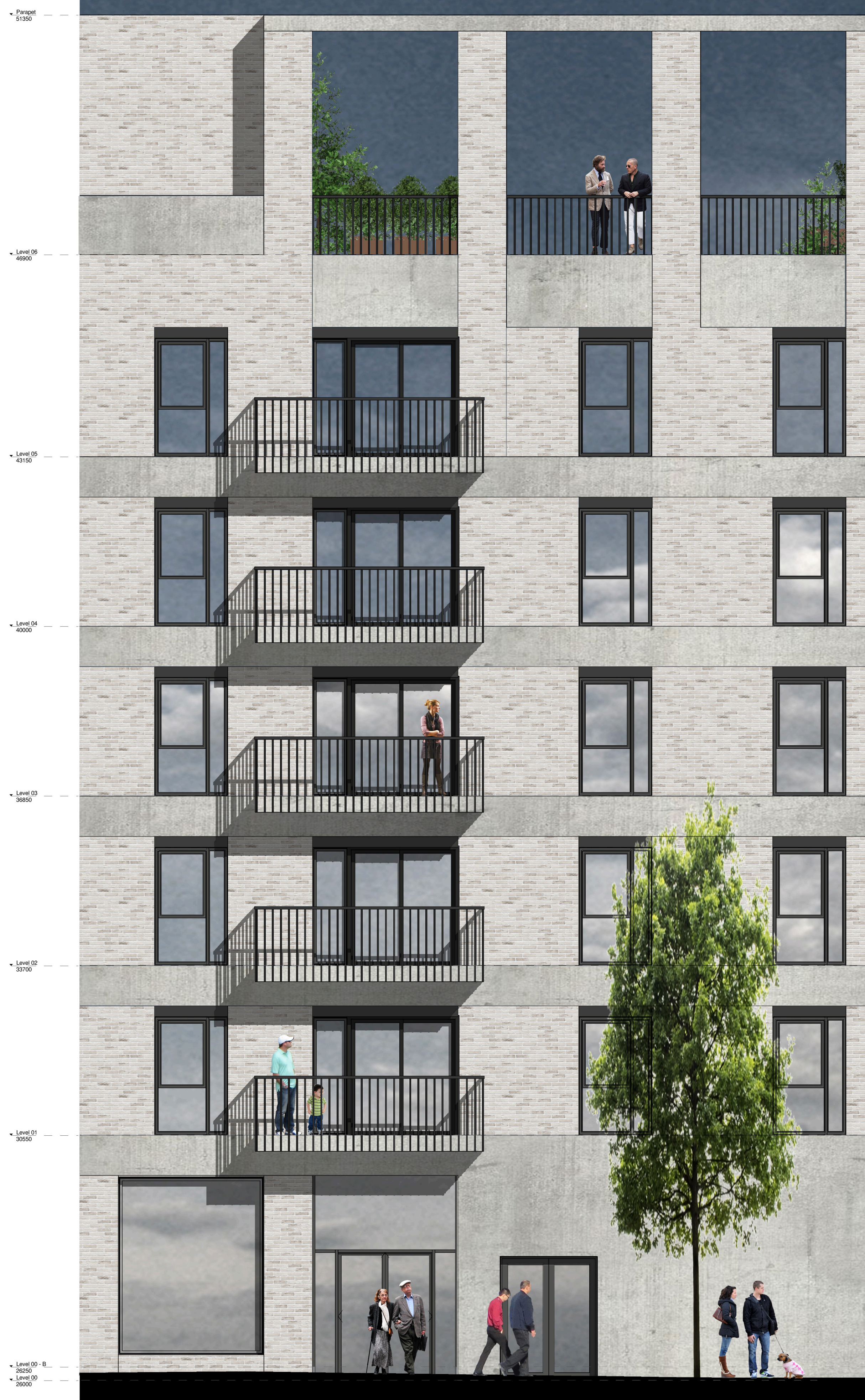
2 Block F Elevation Study 1 : 50